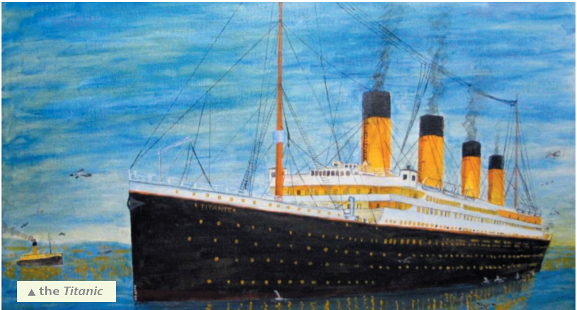
▲ the Titanic

One of the most famous stories of the Titanic is of the band. On 15 April, the Titanic ’s eight-member band, led by Wallace Hartley, had tried to keep passengers calm and upbeat . The band continued playing music even when it